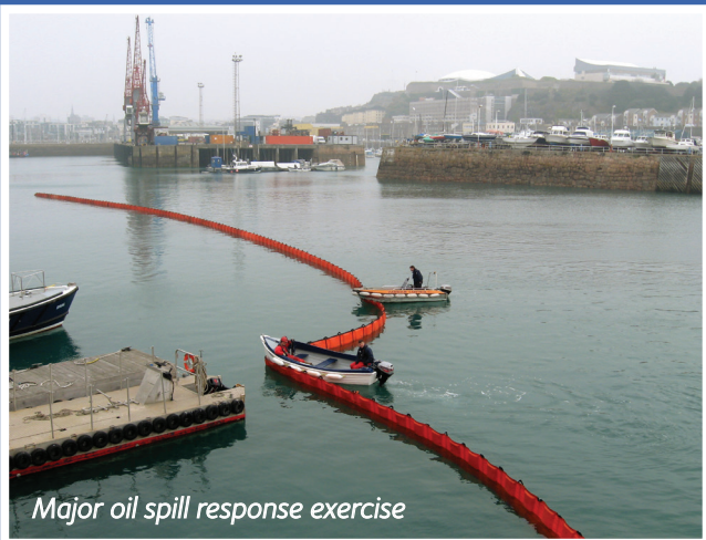
Major oil spill response exercise

There are distinct areas of overlap between these two Laws, therefore to stop duplication of effort and ensure the targeted use of resources the Department of the Environment and the Ports of Jersey have a formal agreement in place. This covers a wide range of topics - from day to day issues to responding to major pollution incidents in marine waters.